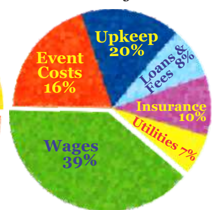
Where it goes