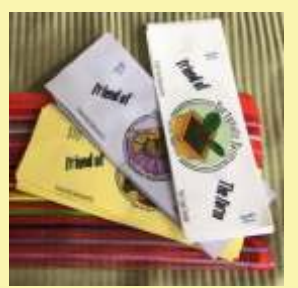
$165 of delicious Caspar-grown veggies from Fortunate Farm

Saturday evening after 8pm, winning bidders will receive emails notifying them of the items they have won. Item pick-up details will be included with the winner notifications. Most items will be available for pick-up on Sunday and Monday, November 20th & 21st at the Community Center. Payment may be made by check or cash (works better for us) or by credit card.