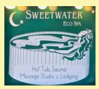
Hot tub, Sauna, two massages by Anne Yount