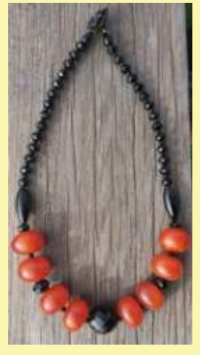
Rhoda Teplow: Carnelian Necklace