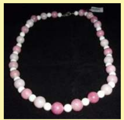
Rhoda Teplow's African Pink Opal Necklace