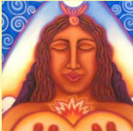
detail from Julie Higgins's Full Moon, New Moon Healing on sale at the auction