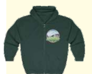
Full-zip Hoodies $40