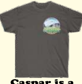
Caspar is a State of Mind (on the back) T-shirts $20