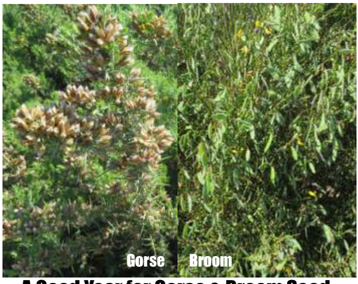
A Good Year for Gorse & Broom Seed on the Headlands