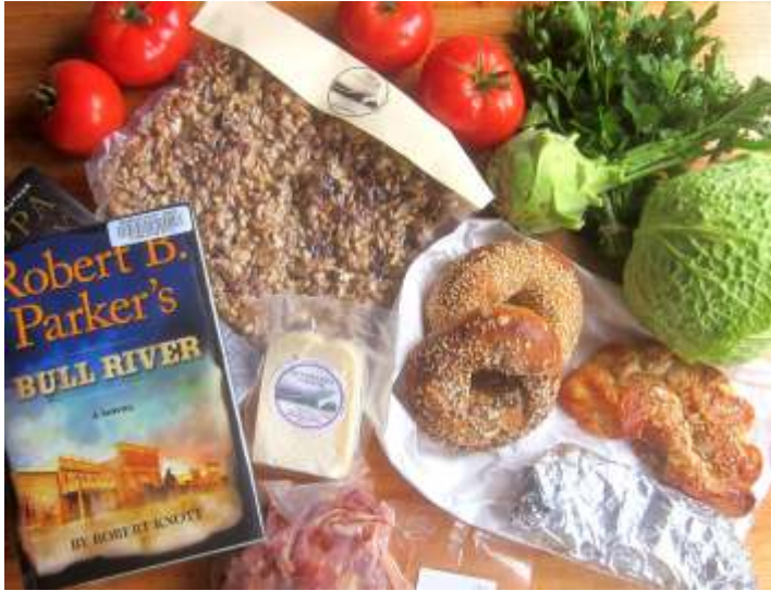
Sienna's Winter Market Basket