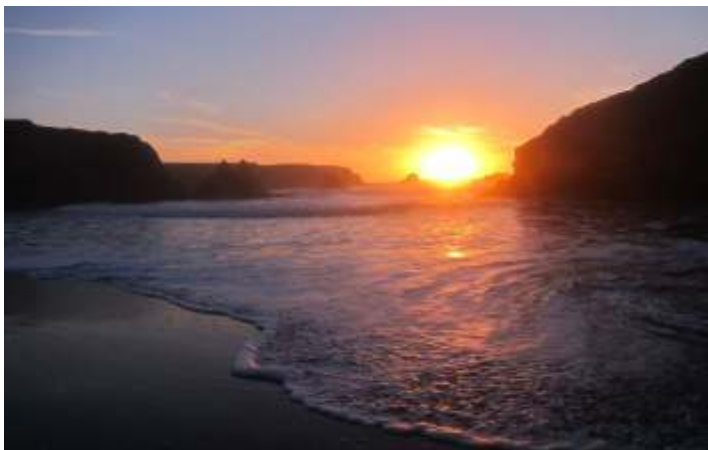
Can you name this beach!