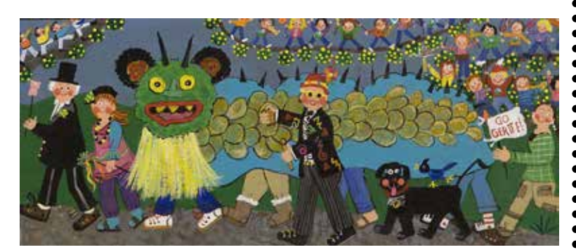
Detail from Sev Ickes' wonderful Caspar Painting Cards available at 4th Sunday Breakfast Posters $20 5 cards for $10 12 cards $20 all proceeds support Caspar Community

If you spend time outdoors in brushy tick-infested areas like our headlands, avoid contact with soil, leaf litter, and vegetation when you can. Wear enclosed shoes and light-colored clothing with a tight weave, so ticks can be spotted easily. Scan clothing and exposed skin for ticks frequently. Use insect repellent that contains diethyltoluamide (DEET) on skin and clothing.